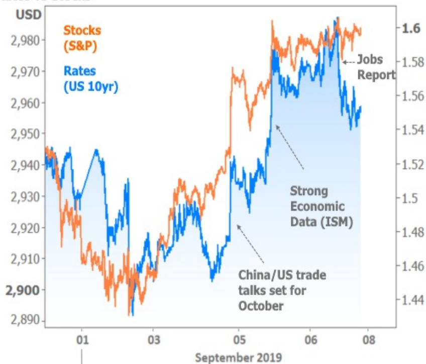
Rates vs Stocks

To be fair to the bond market and the jobs report, it was really only the outright job tally that was weaker than expected. The unemployment rate held at 3.7% despite more workers entering the labor force, and average hourly earnings beat forecasts on a monthly and annual basis. All told, if bond traders were determined to trade rates higher, this report wouldn't have prohibited that. So the fact that rates recovered a bit is somewhat reassuring.