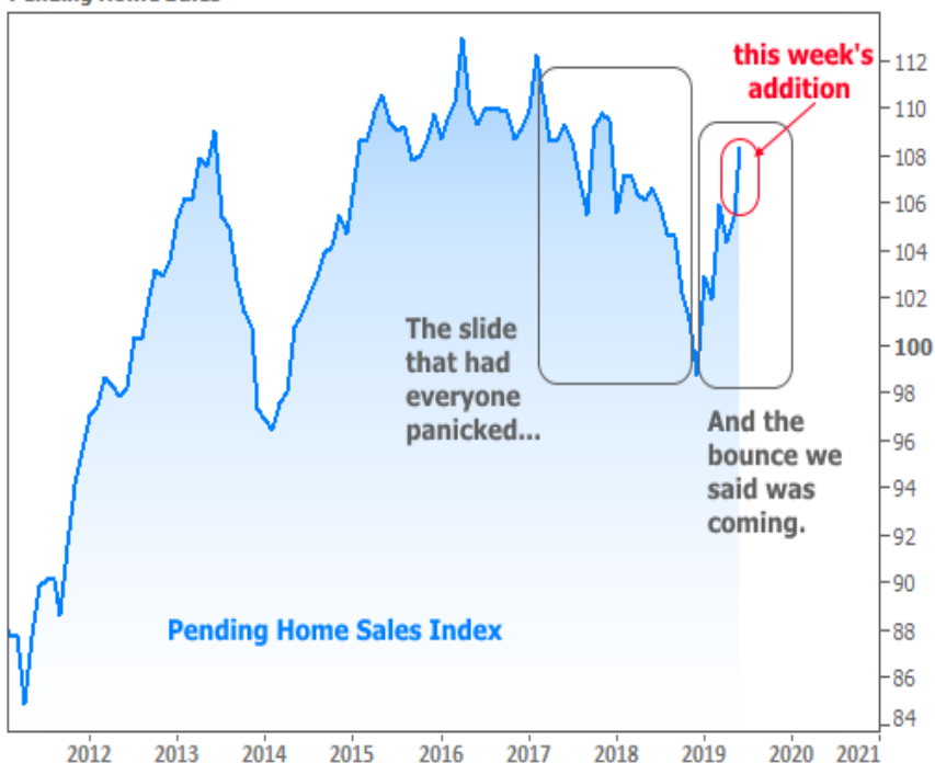
Pending Home Sales

Subscribe to my newsletter online at: http://mortgageratesupdate.com/mattstoutmortgagenavigator