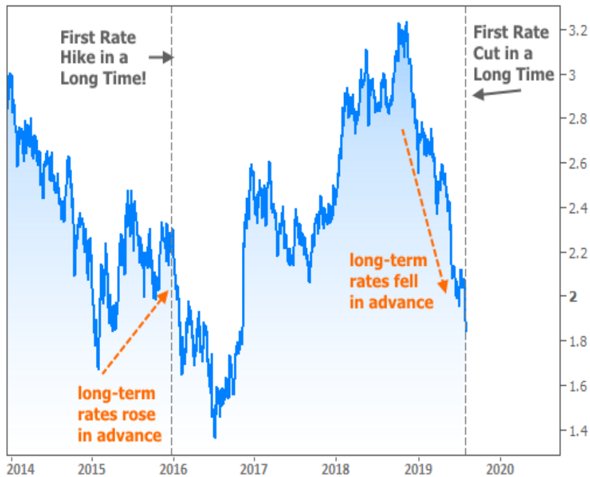
Rates Move Before Fed

To emphasize the point in even simpler terms, consider that stocks LOST ground after the Fed announcement, even though Fed rate cuts are considered to be a good thing for stocks. Like mortgage rates, stocks already had plenty of time to PRICE-IN the Fed's move. That left Wednesday for them to react to other information from the Fed. Specifically, they were a bit disappointed that Powell didn't do more to offer assurances about additional cuts. That's why we saw the lion's share of market movement after Powell's press conference at 2:30pm ET as opposed to the rate announcement at 2pm ET.