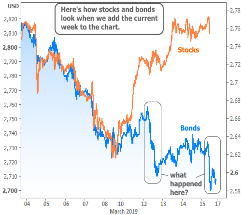
Rates vs Stocks

Clearly, the stock/bond relationship broke down, and clearly, there were a few key moves for either side of the market. What caused them?