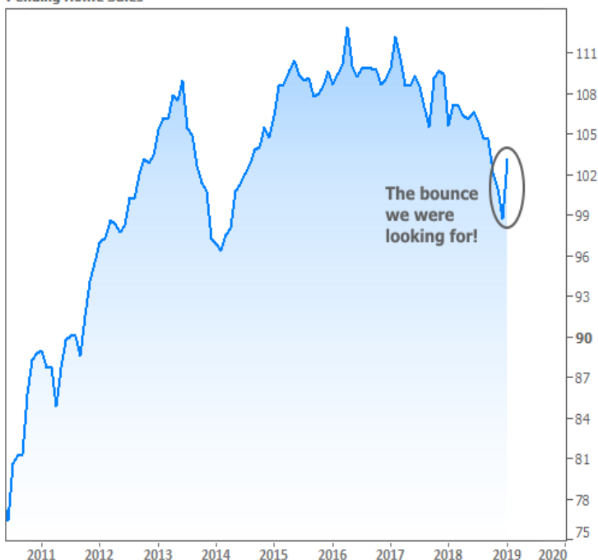
Pending Home Sales

Unfortunately, we also saw the beginning of a fairly abrupt move higher in rates on Wednesday. Early that morning, underlying bond markets (which dictate mortgage rates) began to look panicked. It wasn't immediately clear what caused the move although Brexit-related news was the leading