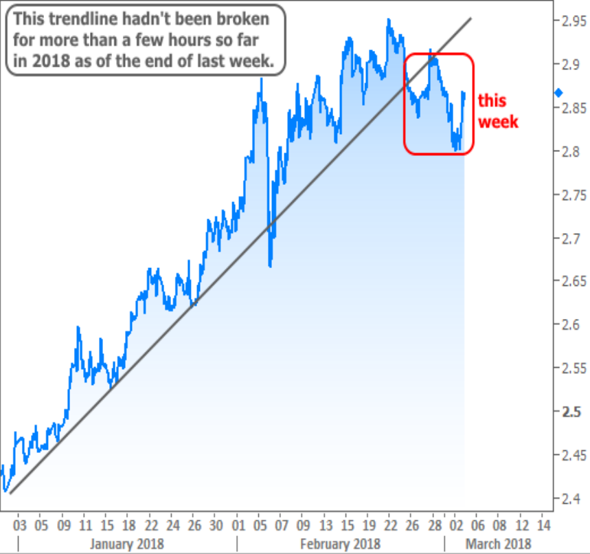
US 10yr Yield ("rates")