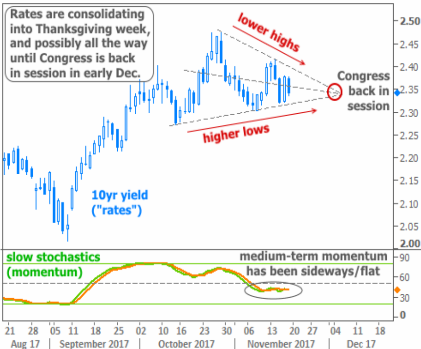
US 10yr Treasury Yield

In the spirit of "waiting and seeing," interest rates improved slightly this week. This keeps them locked in a consolidative trend (higher lows and lower highs) that's been underway for more than a month. It's the bond market's way of expressing indecision, and for now, the trend suggests indecision could linger at least through early December. Even if we apply some esoteric math to recent rate movement and derive a line that measures momentum, that line has been almost perfectly flat for several weeks.