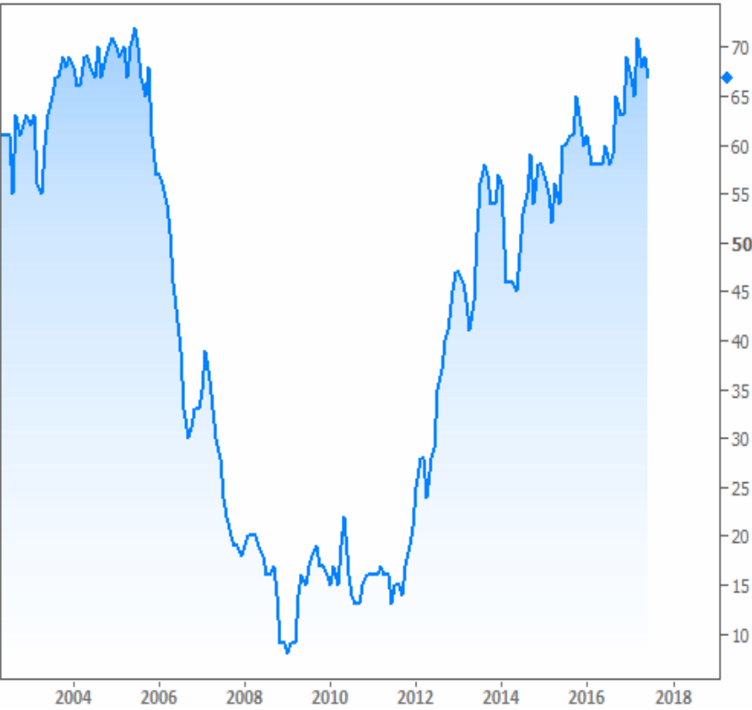
NAHB Housing Market Index

It's harder to offer a compelling counterpoint for Friday's New Residential Construction data from the Census Bureau. Both Housing Starts and Builder Permits came in well below forecasts, prompting National Association of Realtors' Chief Economist to say "housing shortages look to intensify and may well turn into a housing emergency if the discrepancy between housing demand and housing supply widens further."