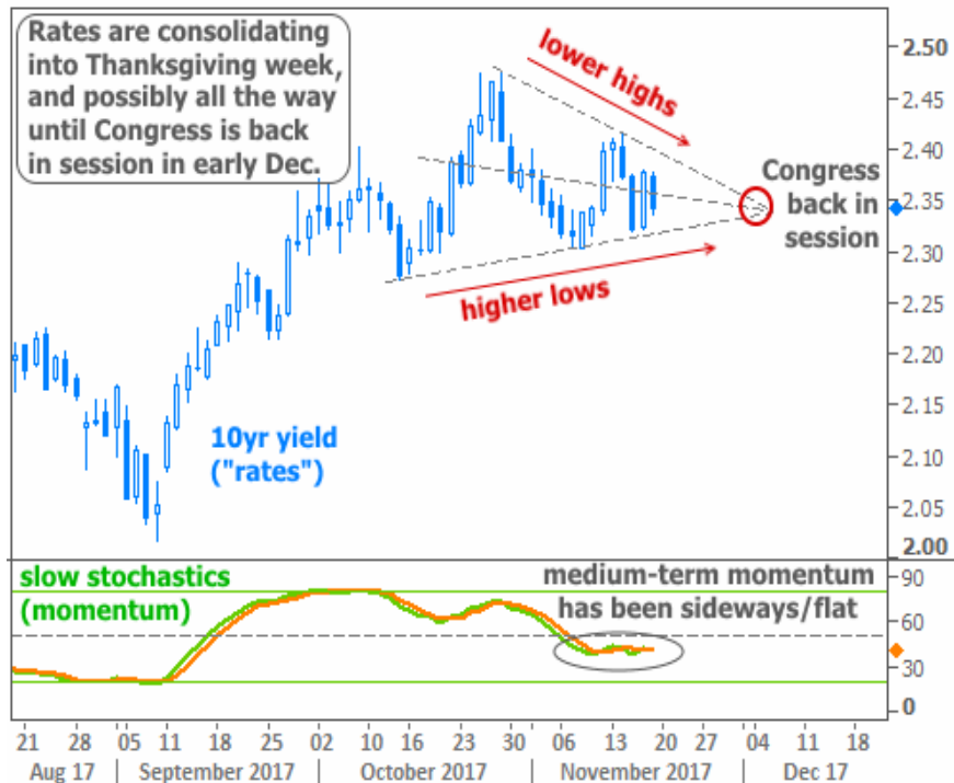
US 10yr Treasury Yield

In the spirit of "waiting and seeing," interest rates improved slightly this week. This keeps them locked in a consolidative trend (higher lows and lower highs) that's been underway for more than a month. It's the bond market's way of expressing indecision, and for now, the trend suggests indecision could linger at least through early December. Even if we apply some esoteric math to recent rate movement and derive a line that measures momentum, that line has been almost perfectly flat for several weeks.