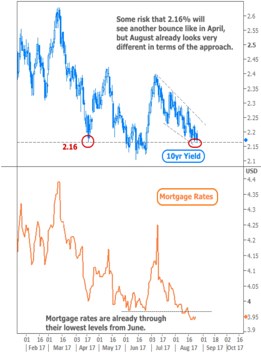
10yr Treasury Yield vs Mortgage Rates

Unfortunately, both New and Existing Home Sales also fell to the lowest levels of the year in reports issued by the Census Bureau and the National Association of Realtors respectively. This data wasn't of great interest to financial markets but it could get more interesting for the housing market. If year-over-year sales continue to operate near or below 0% in the coming months, it could signal the contraction that some economists were worried about last year. For now though, the drop in sales is isolated.