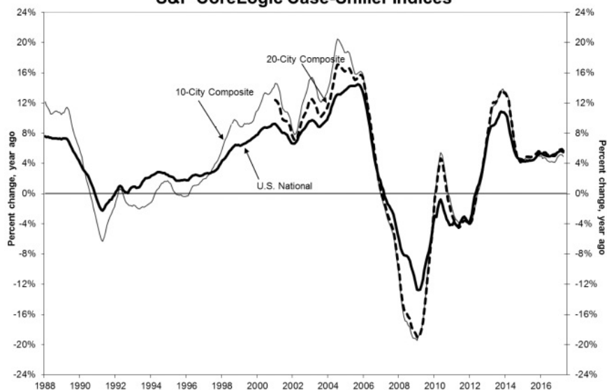
S&P CoreLogic Case-Shiller Indices

Sources: S&P Dow Jones Indices & CoreLogic