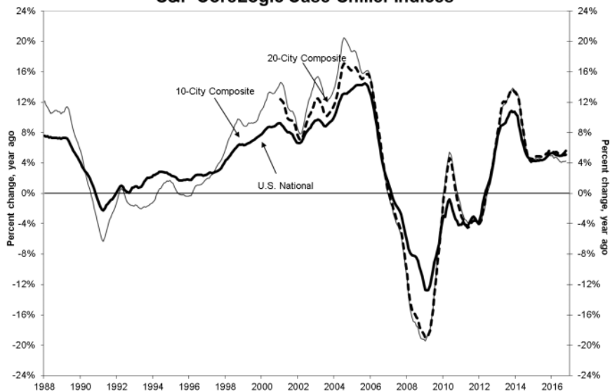
S&P CoreLogic Case-Shiller Indices

Analysts polled by Econoday base their forecast on the 20-City Composite. The report was in-line with their estimates of 5.1 percent with a range of 4.8 to 5.3 percent annually and a seasonally adjusted monthly increase of 0.5 percent.