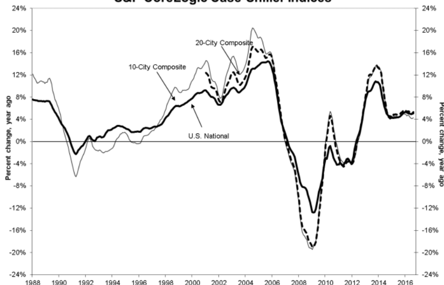
S&P CoreLogic Case-Shiller Indices

Sources: S&P Dow Jones Indices & CoreLogic