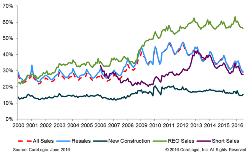
Figure 1: Cash Sales Share by Sale Type Cash Sales Percent

Sales of lender-owned real estate (REO) had the largest all-cash share at 56.2 percent however, as those sales now represent only 4.9 percent of all transactions, their all-cash transactions have little impact on the overall statistics. The cash share of resales, which account for 84 percent of the residential market, was 28.9 percent had the largest impact. Short sales and newly constructed homes bought without mortgages at rates of 27.7 percent and 15.2 percent respectively.