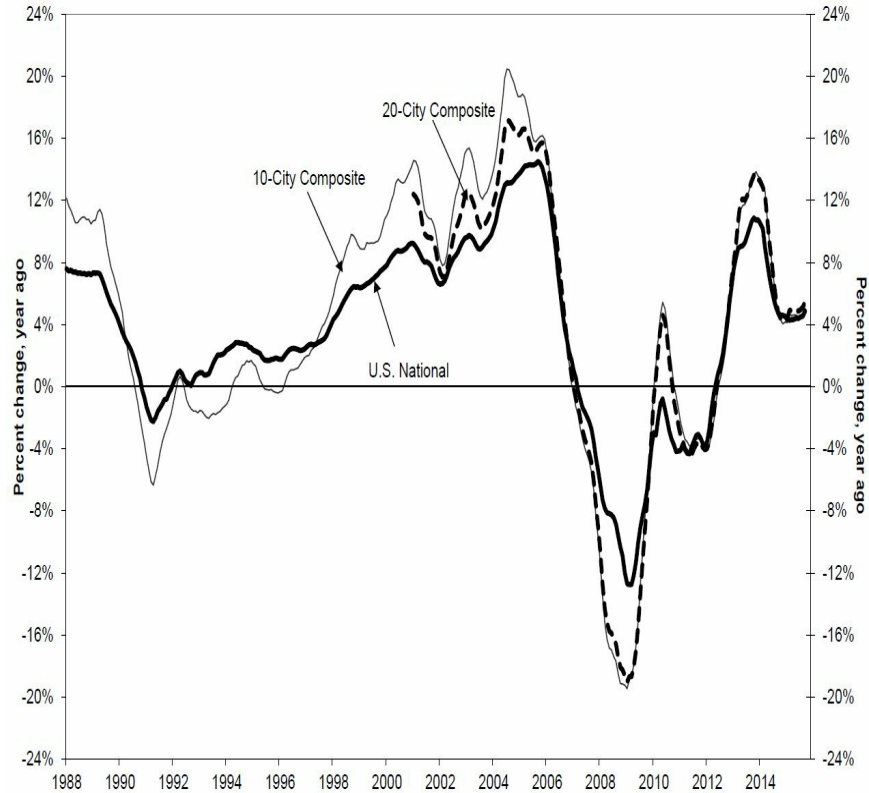
S&P/Case-Shiller Home Price Indices

Source: S&P Dow Jones Indices & CoreLogic