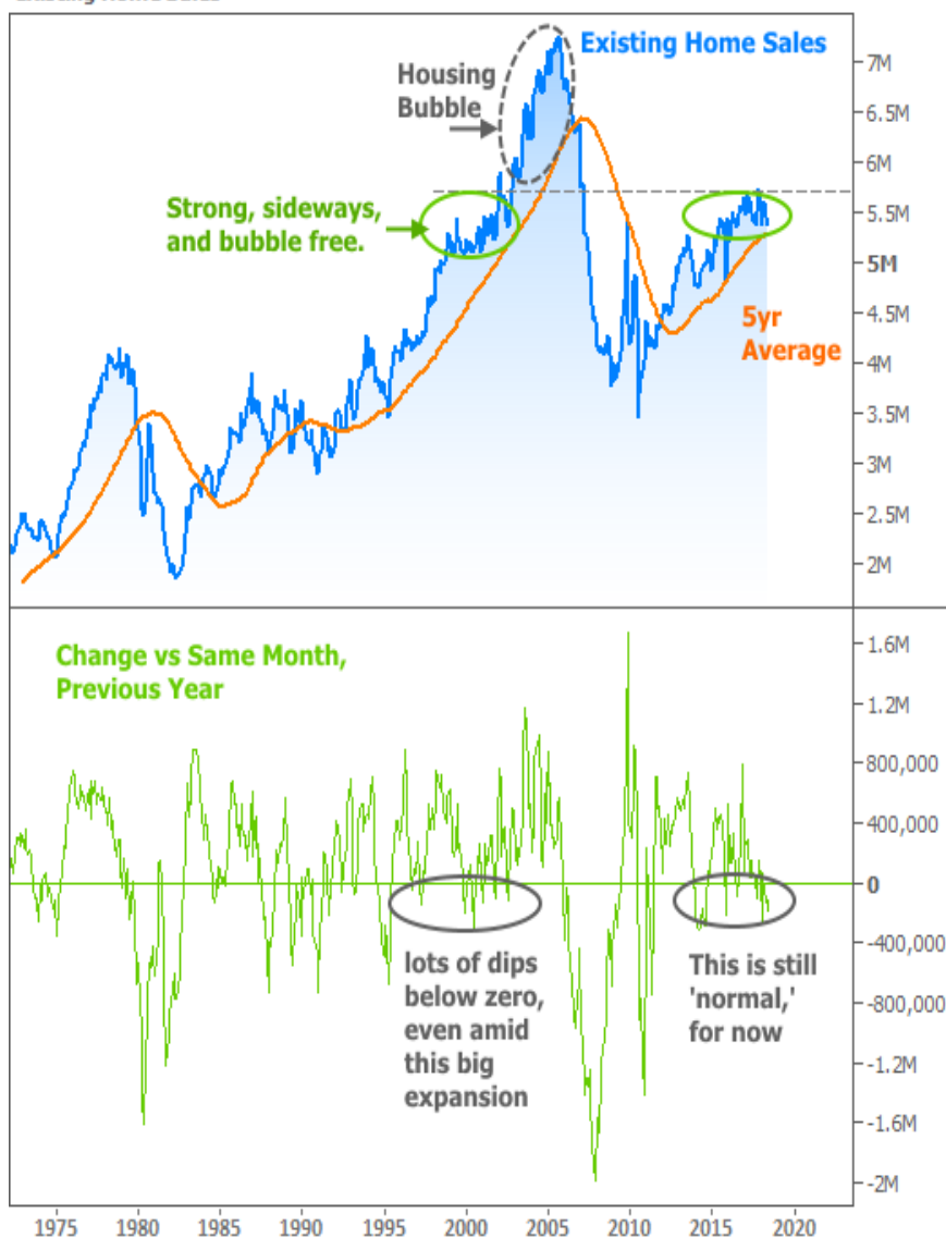
Existing Home Sales

Whereas it might require a deep breath and some perspective to feel optimistic about existing sales, New Home Sales are still very clearly in a linear uptrend. They just happen to be experiencing a move lower INSIDE that trend--one that they've seen at least 4 times in the past 5 years. In fact, the periodic corrections of the past few years are clearly milder than those seen during the previous expansion (as seen at the bottom of the following chart).