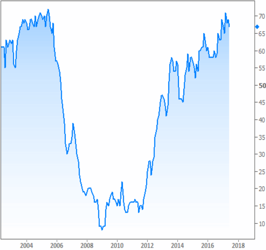
NAHB Housing Market Index

It's harder to offer a compelling counterpoint for Friday's New Residential Construction data from the Census Bureau. Both Housing Starts and Builder Permits came in well below forecasts, prompting National Association of Realtors' Chief Economist to say "housing shortages look to intensify and may well turn into a housing emergency if the discrepancy between housing demand and housing supply widens further."