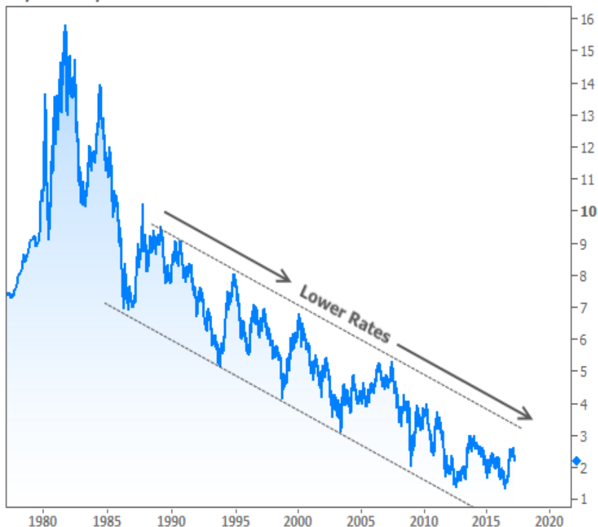
10yr Treasury Yield

Combined with specific expectations for tax reform, the Trump trade was clear : buy stocks and sell bonds (which pushes rates higher). And that's exactly what happened after the election. Moreover, pundit after pundit proclaimed the death of the decades-long trend toward lower rates. This is how that trend looks in terms of 10yr Treasury yields--the quintessential benchmark for longer-term rates (like mortgages):