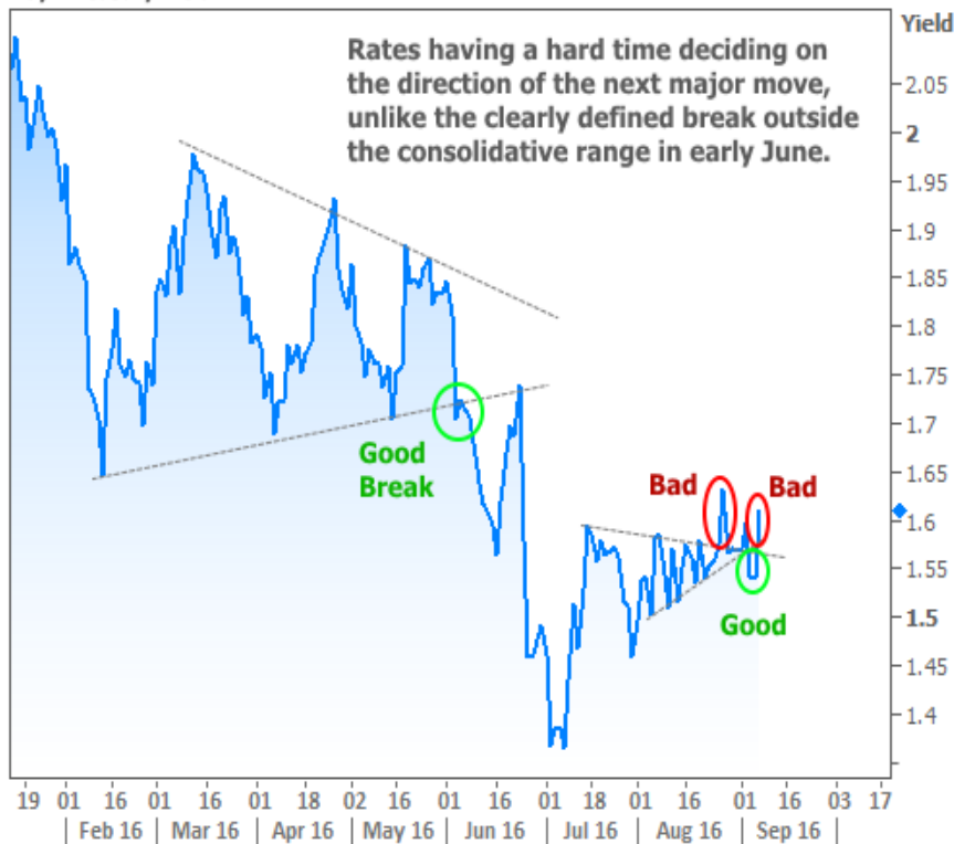
10yr Treasury Yield

Conventional market wisdom holds that rates tend to make bigger moves when they break out of these patterns. Early June was a classic example (as seen in the following chart). But the more recent example is having a hard time making up its mind.