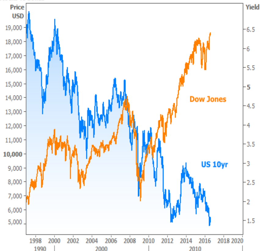
Stocks vs Bonds

Yes, I just said the notion of stocks and oil prices correlating with interest rates could be irrelevant. If that sounds blasphemous to you, consider the following 2 charts showing the long term ( lack of ) correlation.