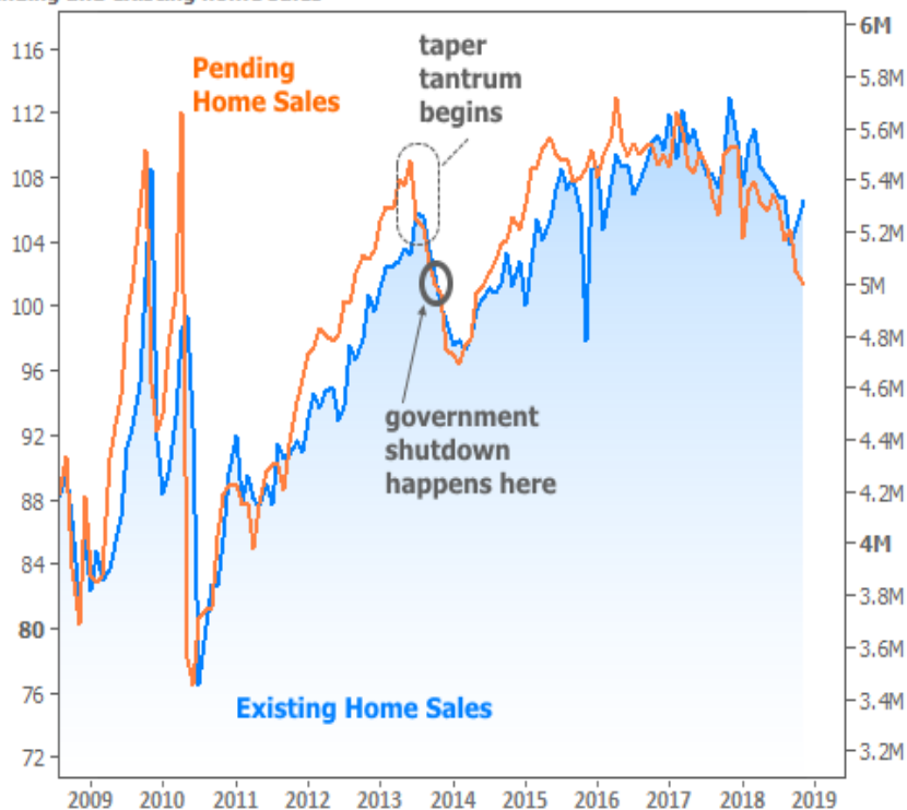
Pending and existing home sales

In the current case, things are a bit different. This time around the government shutdown hit during a fairly decent recovery in interest rates. It will give us a much better chance to see which one matters more. The only catch is that housing sales numbers for the time frame of the shutdown won't be out until later this month, and the most meaningful numbers won't be out until February or March.