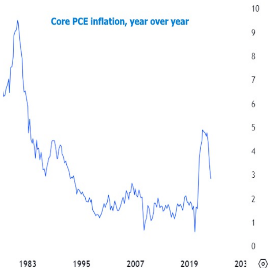
Core PCE inflation, year over year

While it's no longer necessarily a top priority, the Fed would also not mind seeing some more slack in the labor market and some other signs of economic weakness to bolster the case for further disinflation. If the economy is too strong, they need to wonder if inflation might pick back up.