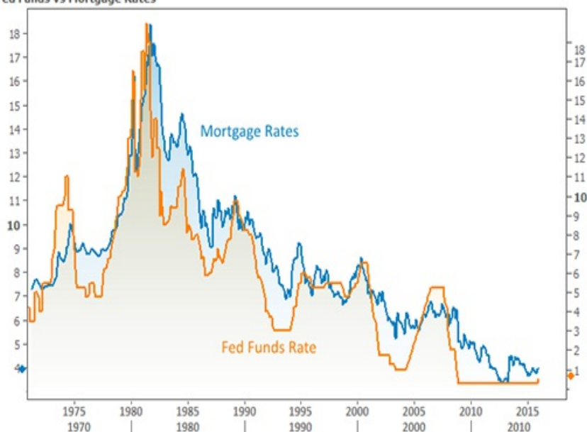
Fed Funds vs Mortgage Rates

What the chart DOESN'T show —at least not as obviously—are the subtleties that help brighten the outlook. First of all, notice the last Fed hike in 2004. At the time, mortgage rates actually moved slightly lower just after the Fed raised rates. The reasons for that are similar to the present-day reasons.