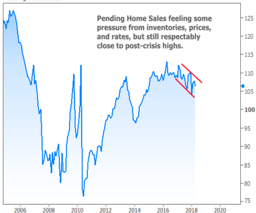
Pending Home Sales

Subscribe to my newsletter online at: http://mortgageratesupdate.com/billhills