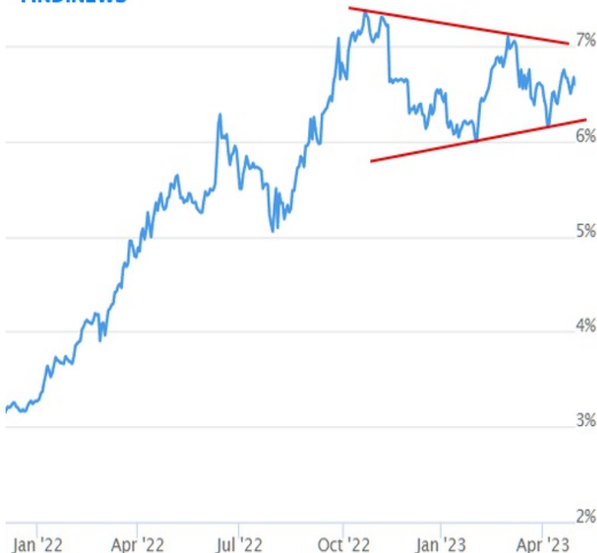
30yr fixed mortgage rate index MND.NEWS

There's a slightly smaller version of the bigger picture seen in 10yr Treasury yields, which tend to correlate highly with mortgages.