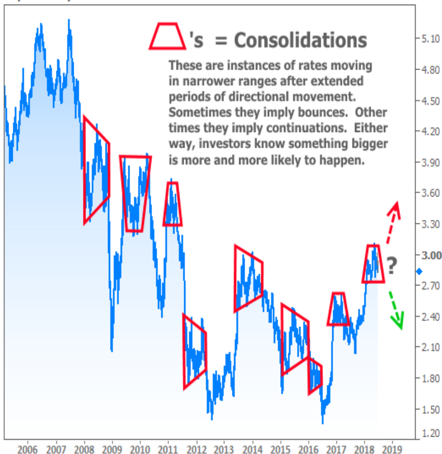
10yr Treasury Yield

We can't be sure if it will be a "bounce" or a "continuation"--only that it's coming. In the current case, investors are particularly interested in the stock market's consolidation because of where it sits in the grandest of schemes.