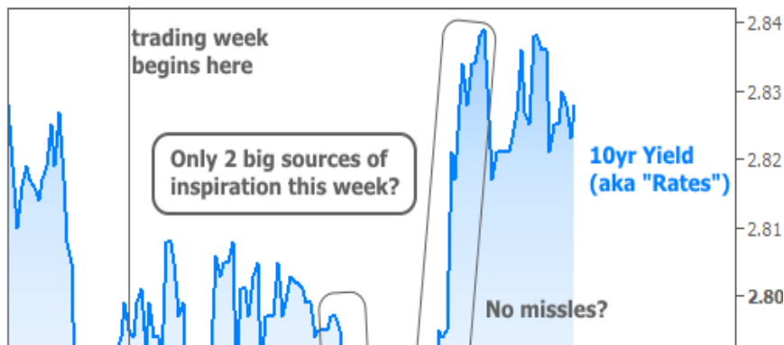
Stocks vs Bonds

The 2nd and 3rd panes of the chart put the Tweets into context and will be discussed below.