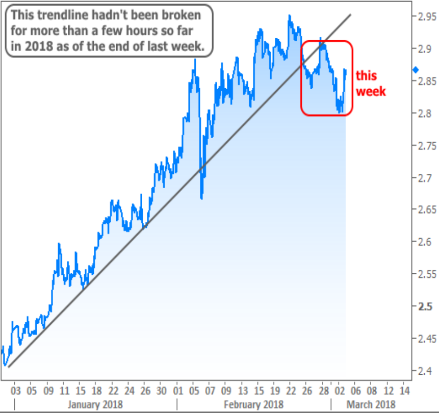
US 10yr Yield ("rates")